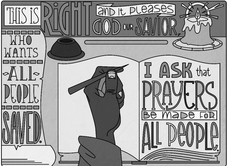
| Timothy 2:1-7 • illustratedministry.com

8505 Church Street | Crystal Lake, IL 60012 | 815.459.1132 www.rclpc.org | office@rclpc.org